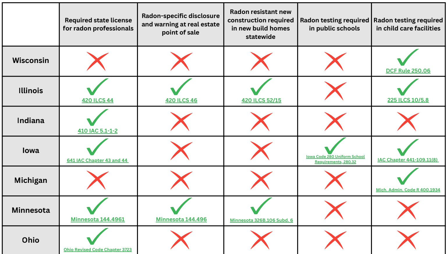
Table 1 - A comparison of state-level radon policy strategies used by neighboring states.