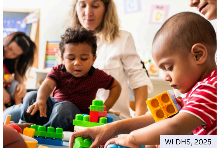
WI DHS, 2025

From March 2023 to October 2025, 80 child care centers across Wisconsin have mitigated high radon, protecting at least 2,060 children and their caretakers from exposure to high radon levels.